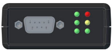
RS-232 Input (DB9 male)